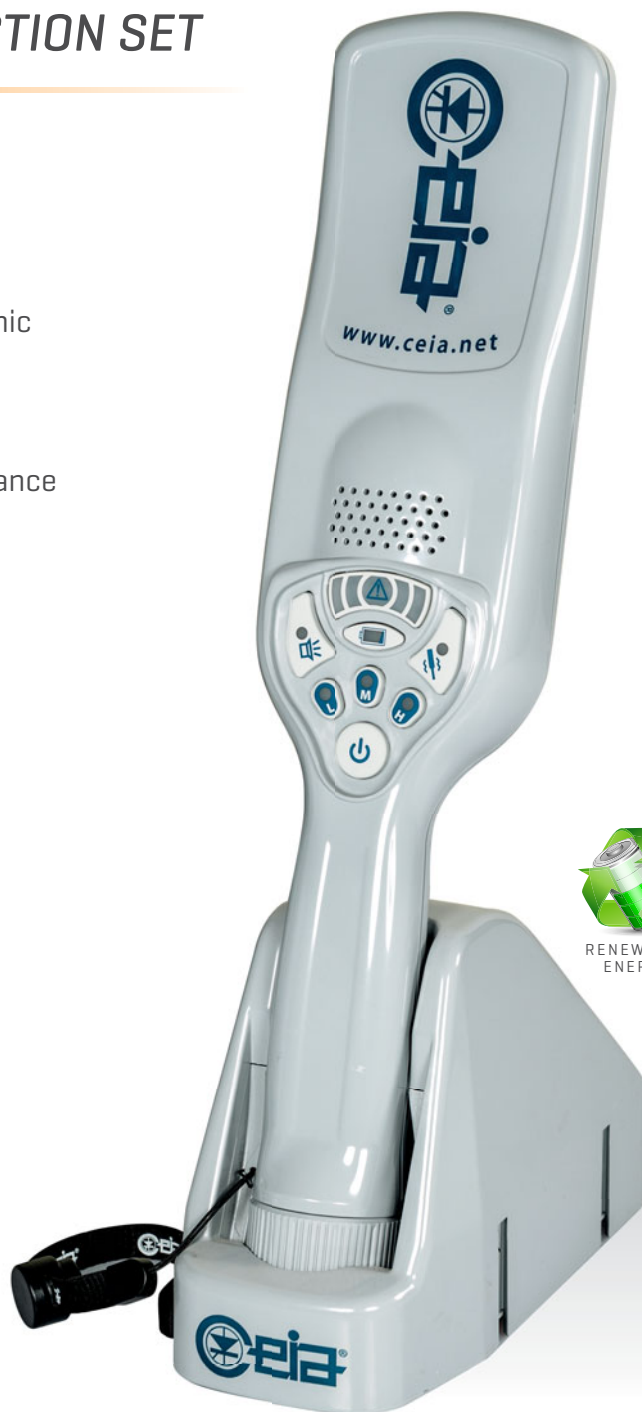
PD140N HAND HELD DETECTION SET