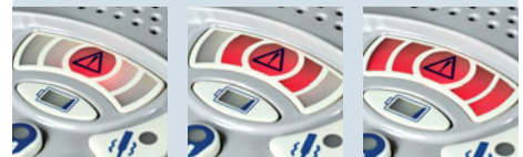
Optical indication proportional to the metal signal strength (Low, Medium, High).