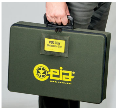
PD140N HAND HELD DETECTION SET WITH CARRY BAG