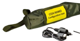
HHMD CONFIGURATION TOOL [# 63537]