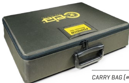
CARRY BAG [# 64082]