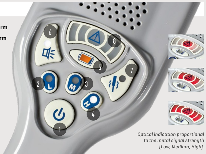
Optical indication proportional to the metal signal strength [Low, Medium, High].