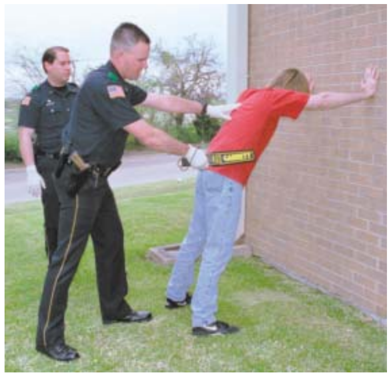
Garrett's Super Scanner can search any suspect thoroughly and safely.

body. They are a safe and effective method of determining the presence of metal on a suspect. When used in conjunction with the agency's search and seizure policy, metal detectors can reduce the occurrence of injuries and deaths caused by deadly concealed metallic object such as guns, knives, razor-blades and hypodermic needles. Using a Super Scanner when searching suspects, combined with a diligent and thorough effort to identify all detected metallic objects, can help save the lives of officers in the future.